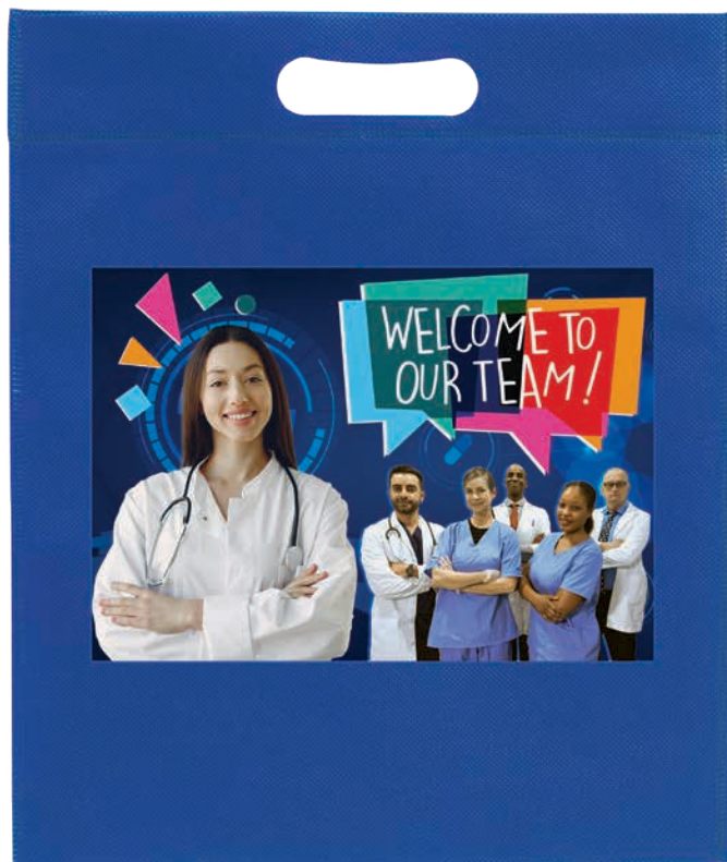
13W x 15H x 3 COLOR VISTA

Imprint Area: Front/Back – 8W x 8H (Screen Print) Front/Back – 10W x 7H (ColorVista & Sparkle) Front – 7W x 7H (Dynamic Color)